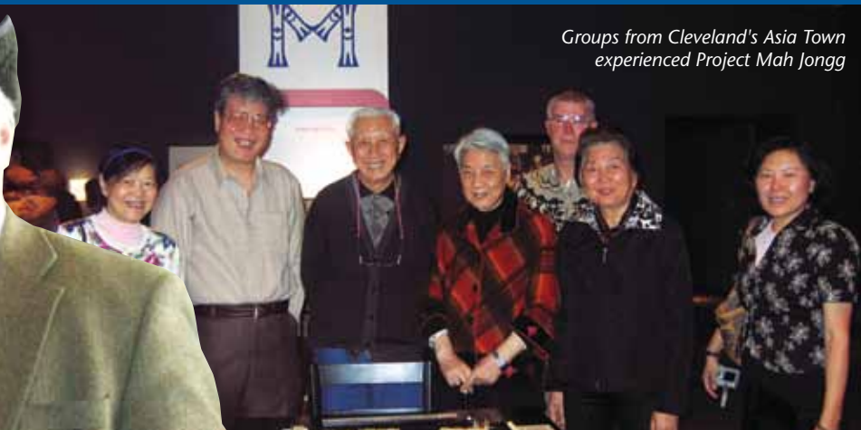
Project Mah Jongg delighted audiences of all kinds.

Groups from Cleveland's Asia Town experienced Project Mah Jongg