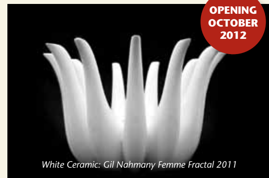
White Ceramic: Gil Nahmany Femme Fractal 2011