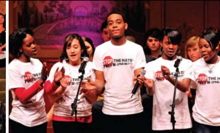
Greater Cleveland Young Marines joined the Ceremony

CMSD SuccessTech Academy "Retro Rappers" perform original rap music with positive themes