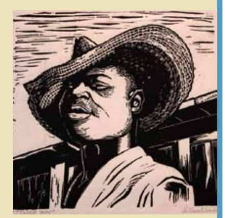
Stable Boy

Photographer Bergholz intrigued by the vibrancy and energy of Tel Aviv during a recent trip, captured riveting images which show the real nature of the city today. His work has been shown at the Cleveland Botanical Garden, SPACES and the Mattress Factory in Pittsburgh.