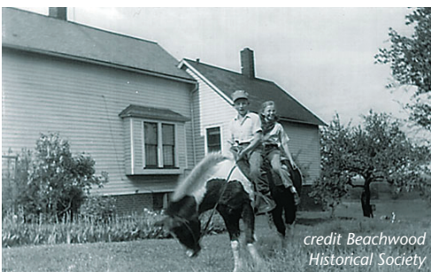
Future site of the Maltz Museum, 1940