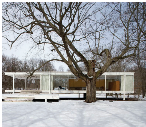
Farnsworth House, Plano, Illinois. Designed by Ludwig Mies van der Rohe