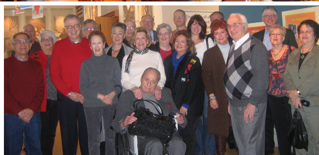
Imagine the Possibilities at the Maltz