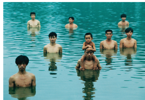
Zhang Huan, To Raise the Water Level in a Fish Pond