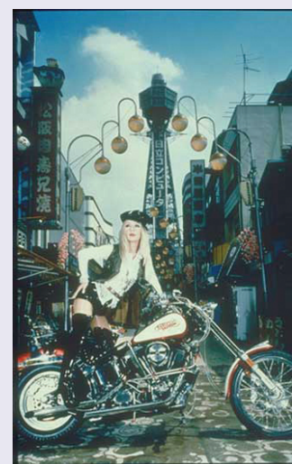
Yasumasa Morimura, (Actress)/After Bridgette Bardot 2, 1996

Artworks range from painting and sculpture to the modern technology of video installation. Works from well-established artists share space with emerging talent. Docent-led tours can be reserved for adult and student groups of ten or more, with discounts for groups of 15+. Packs of 35 or more tickets are available at a discounted price.