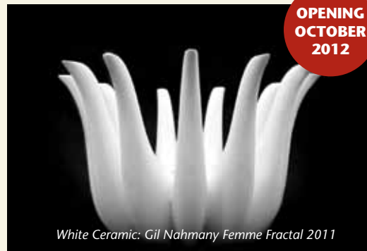
White Ceramic: Gil Nahmany Femme Fractal 2011