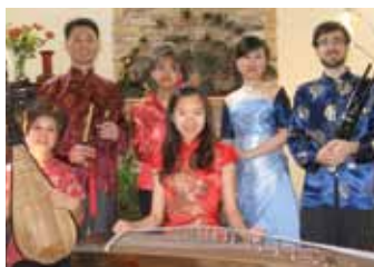
Cleveland Chinese Music Ensemble

Immerse yourself in the uniqueness of Chinese culture as the Cleveland Chinese Music Ensemble presents an intimate evening inspired by the fanciful images on mah jongg tiles—the four seasons, winds, flowers and dragons—played on traditional Chinese instruments interspersed with selected readings (in Chinese and English) of evocative poems from China's classical antiquity.