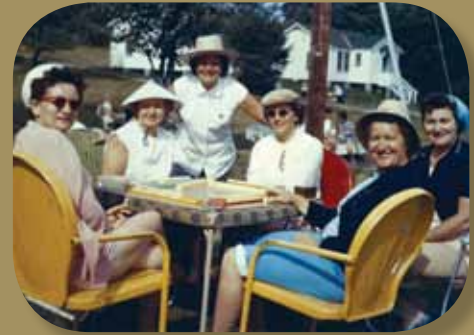
Women playing mah jongg in the Catskills, c. 1960