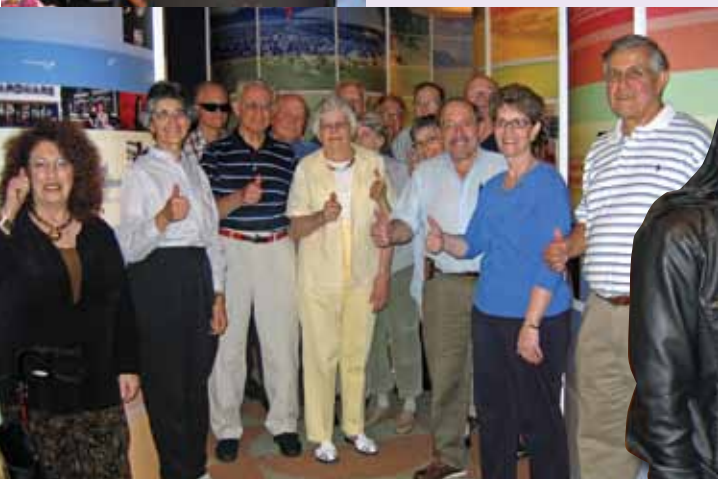
Shaker Rotary Club said thumbs up after their Maltz Museum tour.